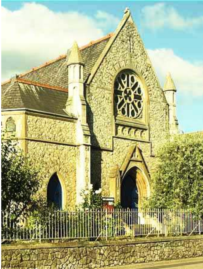
Emmanuel Church Sidcup