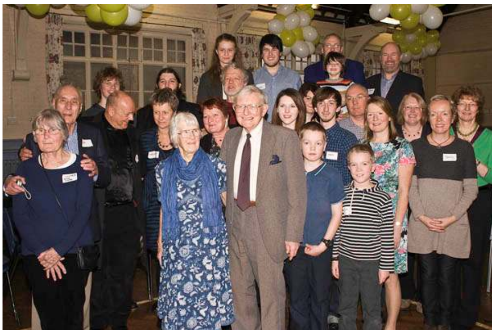
The family group